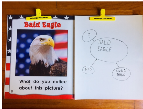
Above: A WO-WO is applied to a big book to facilitate enhanced comprehension.